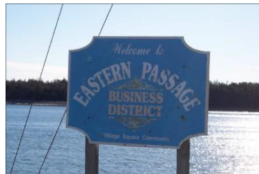
Welcome to Eastern Passage