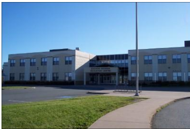
Eastern Passage Education Ctr